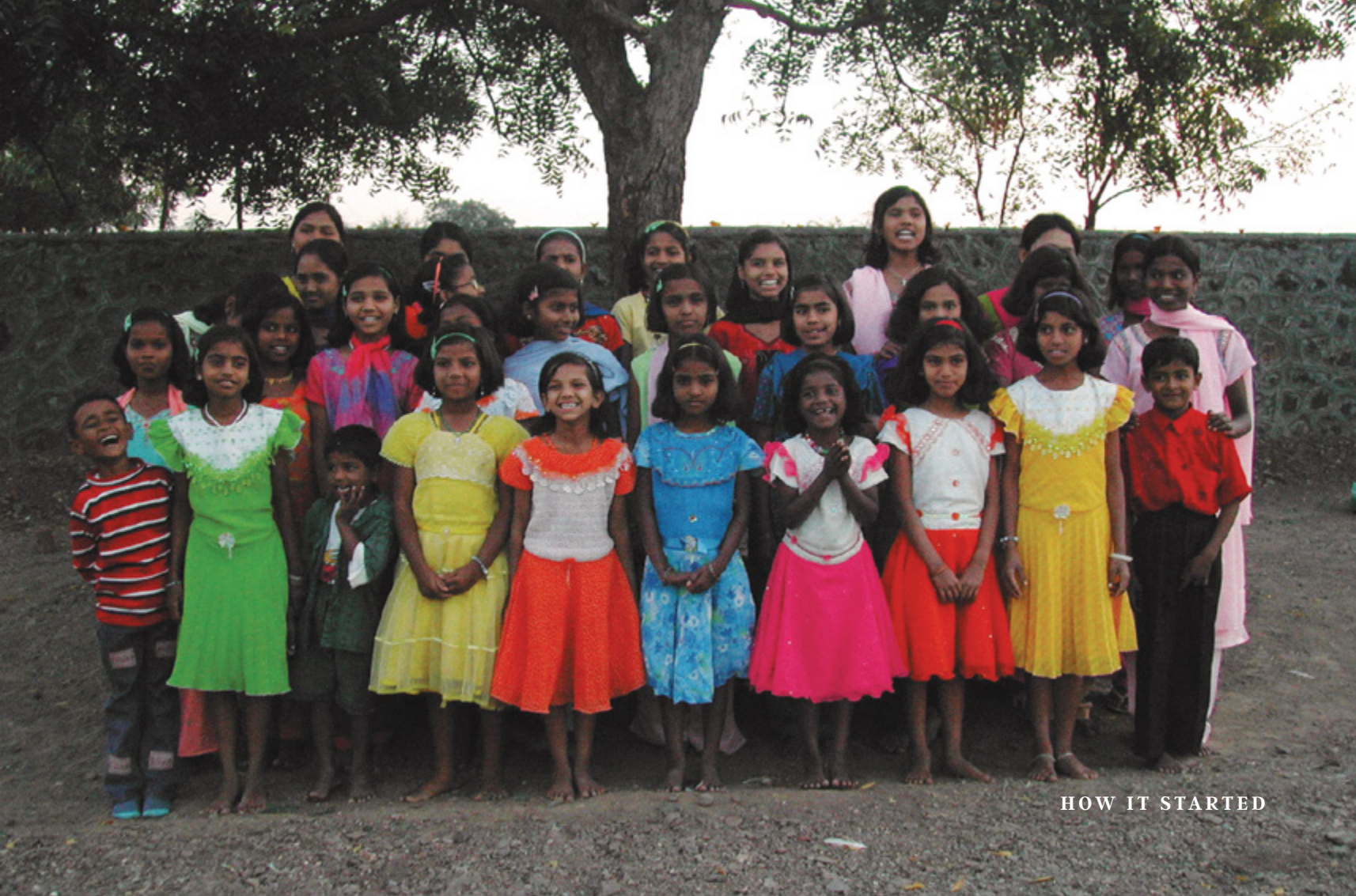
HOW IT STARTED

In 2007 when I started this journey, I took over a fledgling orphanage with limited resources – it was much like many orphanages in India and around the world. These children who came from hard places had their basic physical needs met of food, shelter and clothing. They went to the local language government school where they learned very little and often ended up in devastating life circumstances. They remained powerless against the generational cycles of extreme poverty and exploitation that continued to plague their family. The solutions and systems were broken.