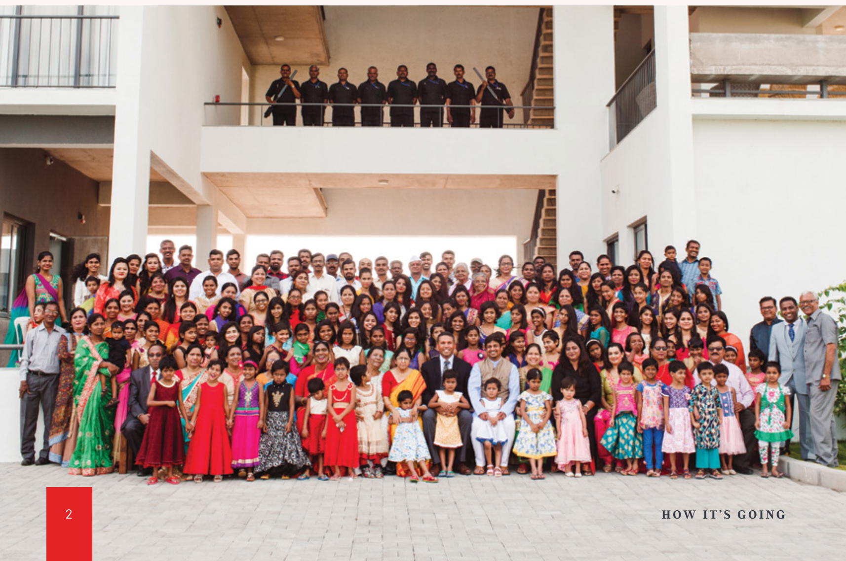
HOW IT'S GOING