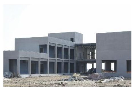
Pre-K-6 School building under construction

The Leadership Center brings us the opportunity to enhance our training for both our staff and partner orphanages. Here we can train our staff, host and conduct guest lecturers, provide space for conference meetings, and host overnight guests in comfortable accommodations.