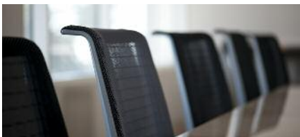
Leadership Center..... $75,000 Furniture, Fixtures, and Equipment