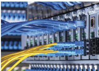
Internet & Phone..... $5,000 Communication