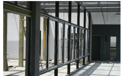
Partitions and windows installed at the school