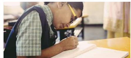
3 Classrooms + Library ..... $50,000 Furniture, Fixtures, and Equipment ($12,500/class)