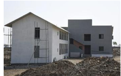
Girls' home with the first coat of paint