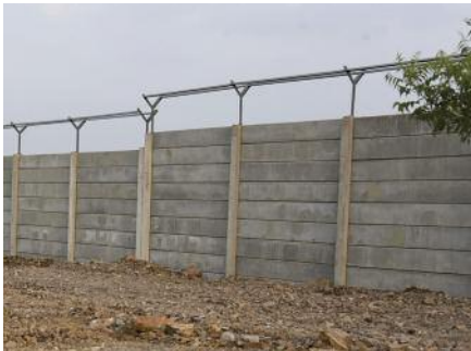
Security Wall..... $116,000