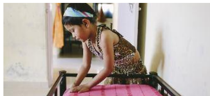
2 Girls Homes ..... $44,000 Furniture, Fixtures, and Equipment ($22,000/home)